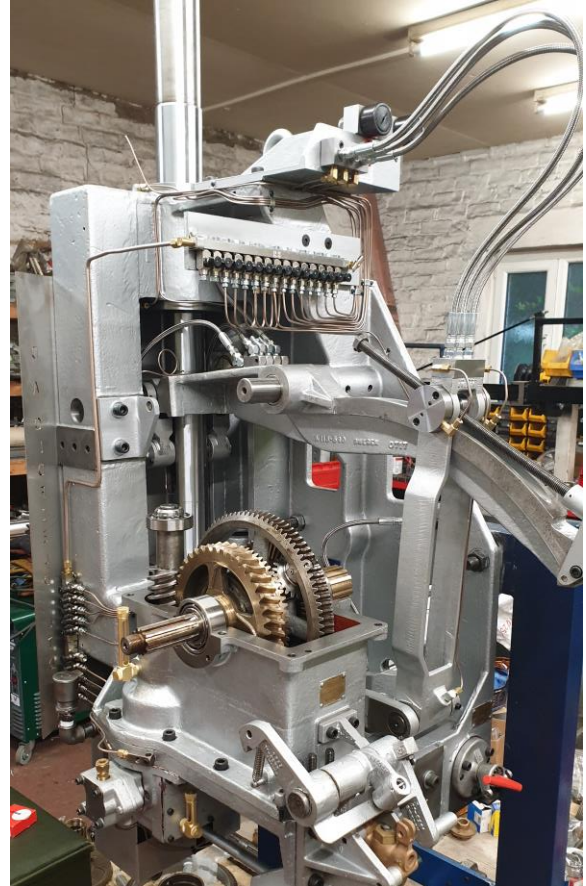
Figure 2. Part built mechanism

Our feeder mechanism service exchange service is open for both 81 and 503 feeders with either 5" or 7" stroke and 10:1 or 20:1 gearbox ratio.