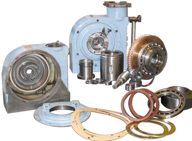
Figure 1. A sample of the parts found in the gearbox