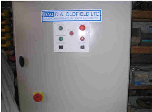
Figure 2. Control panel.

The control panel supplied with the machine and shown in figure 2 is for remote mounting or can be mated on the side of the stacker. It houses all the components to synchronise, run and control the stacker, including inverter and programmer.