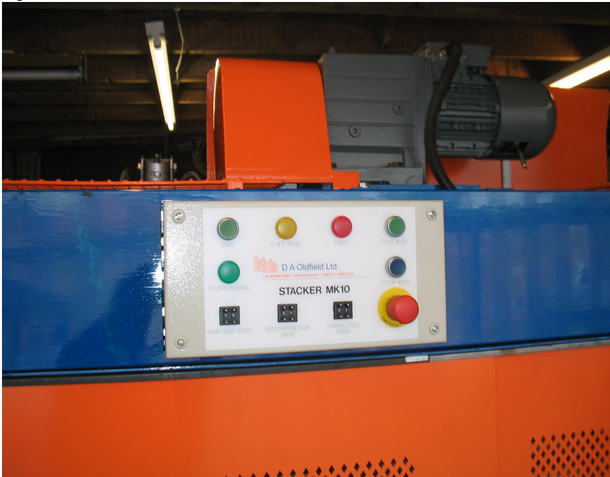
Figure 1.MK10 Stacker.

There are three frame sizes to coverlehr widths from 1.5 to 4.0 meters with a cycle speed up to 14 per minute.