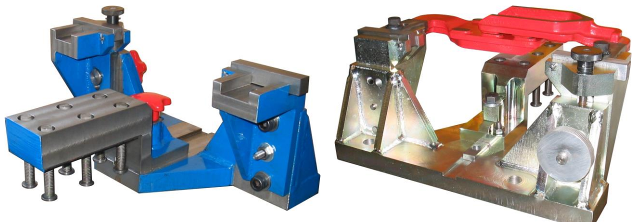
Figure 1 and figure 2 show Single Gob & Double Gob "angular" shearing Fixture available for 3" and 4 3/8" centres. For use on Feeder numbers: 58,144, 81,115 and 515.

Figure 2.DAO 94-27 Shear arm alignment jig. Also used for checking the Shear blade fixture.