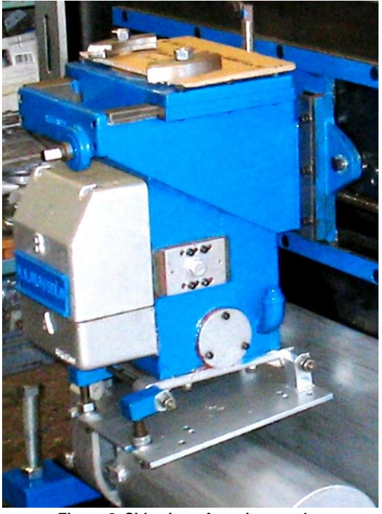
Figure 2. Side view of moving gearbox