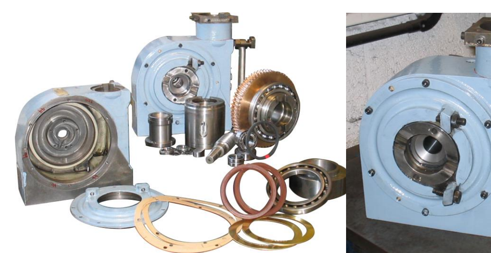
Figure 1. A sample of the parts found in the gearbox

'Emhart style' 210-480 61/4" Servo Take Out Gearbox Overhaul & Spares Kit.